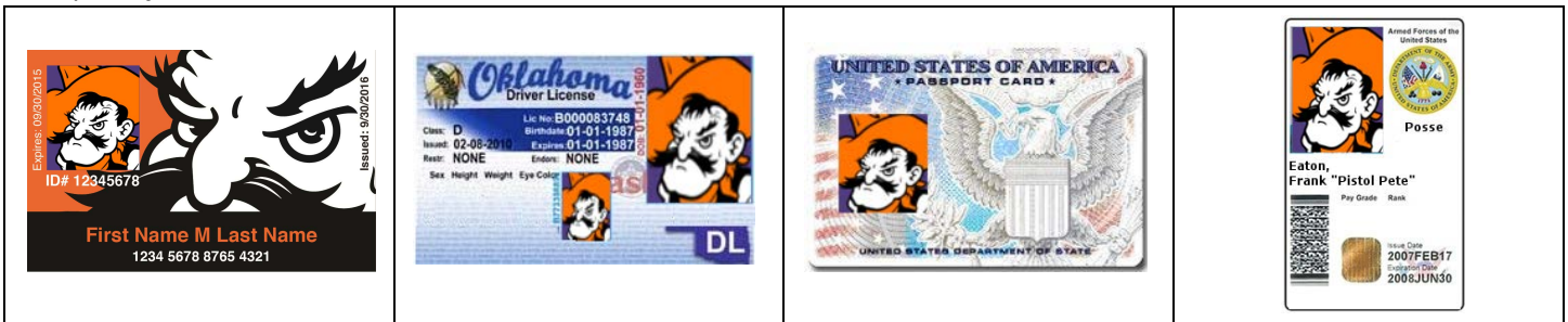
OSU ID Card